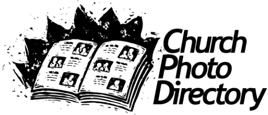
Photo Directory Pictures Will Be Taken This Month